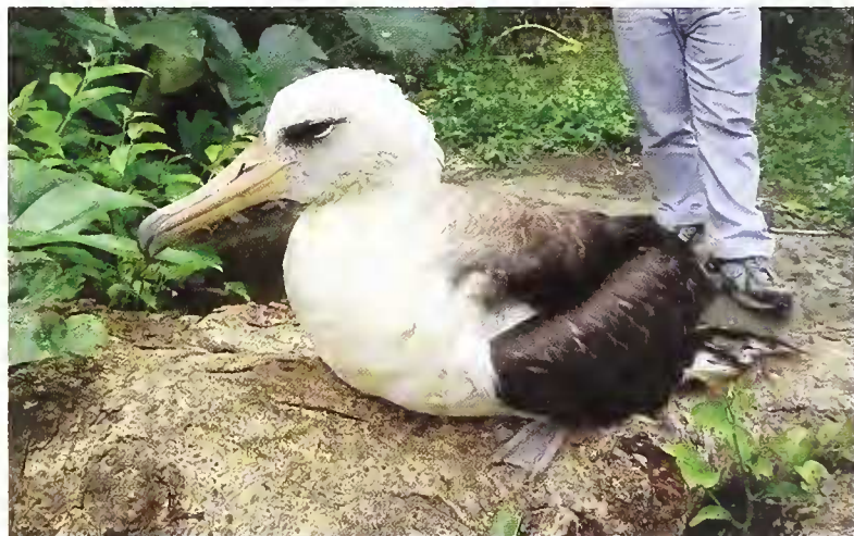
Plate 4. Injured Laysan Albatross Phoebastria immutabilis , Bibincahan, Sorsogon City, Luzon, 10 January 2014.